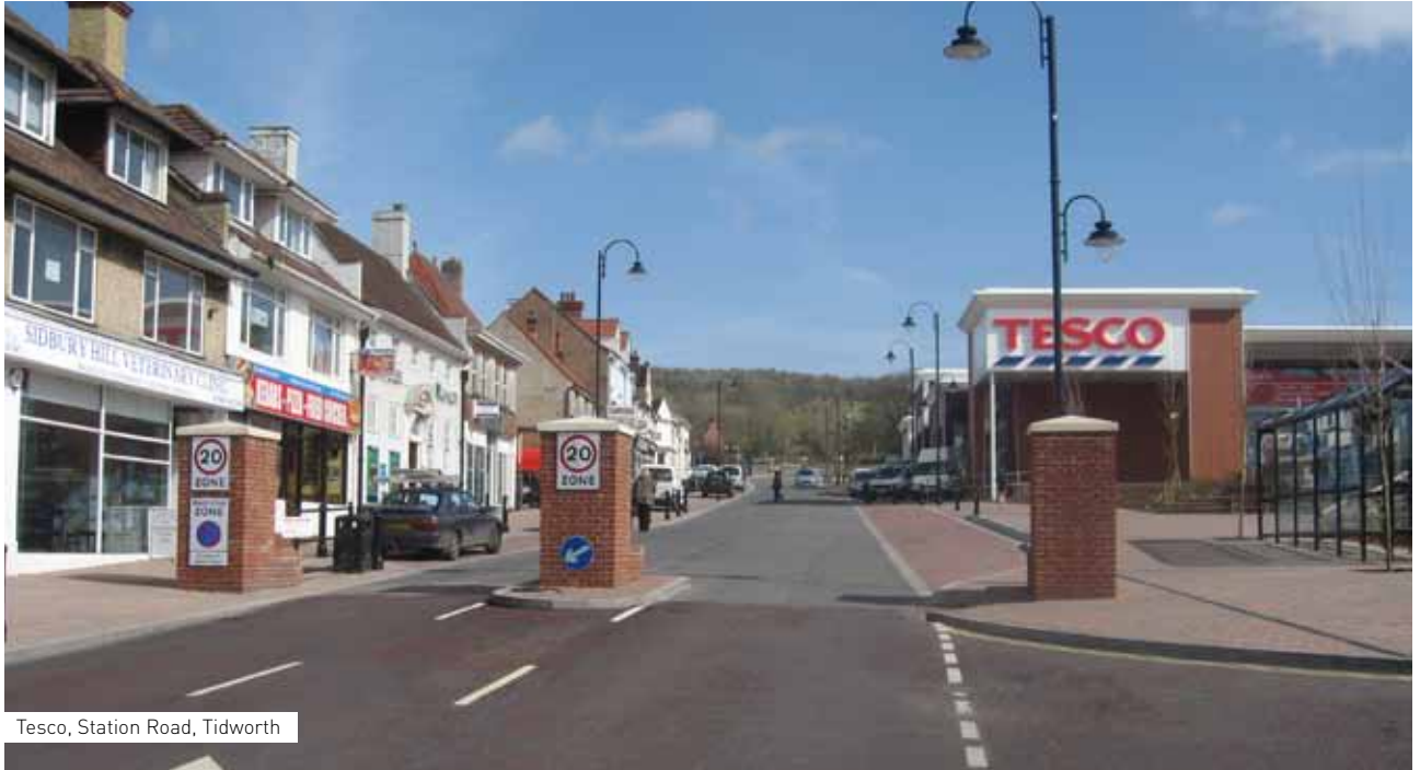
Tesco, Station Road, Tidworth

Transport Planning Traffic Engineering Highway Design